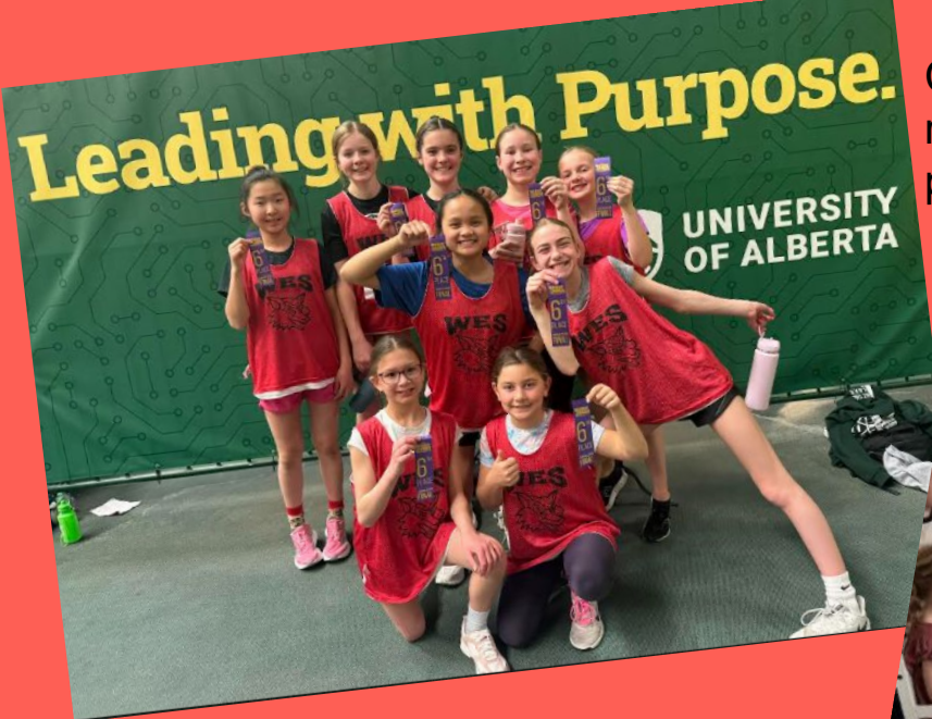
Congrats to the girls running room team for coming in 6th place in the consolation final!