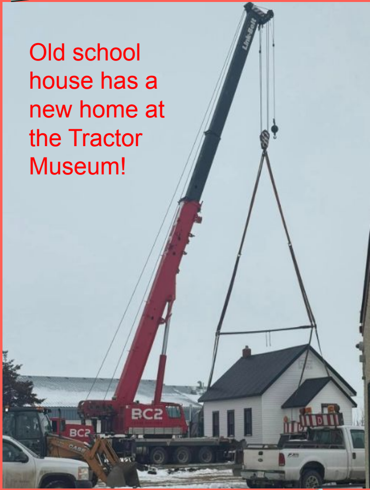
Old school house has a new home at the Tractor Museum!