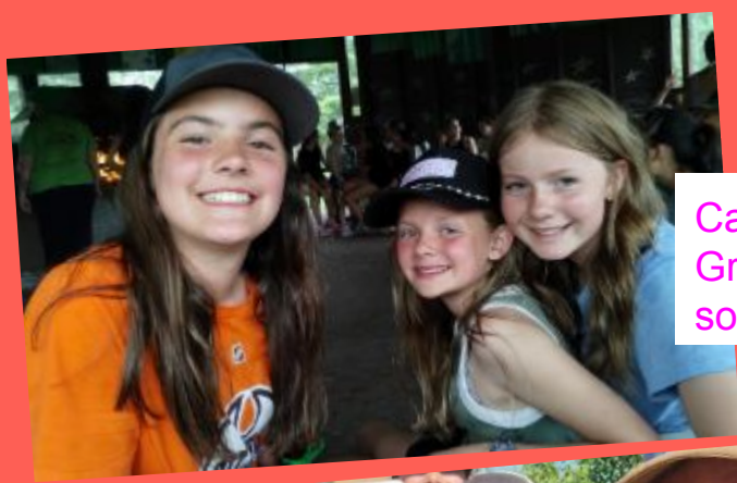
Camp Warwa for Gr. 6 students was so much fun!!